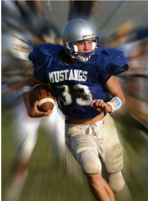
The Zoom Blur effect can add drama and motion to an image.

This cool effect uses a blur filter to bring attention to the subject of a shot and to add some drama to an image.